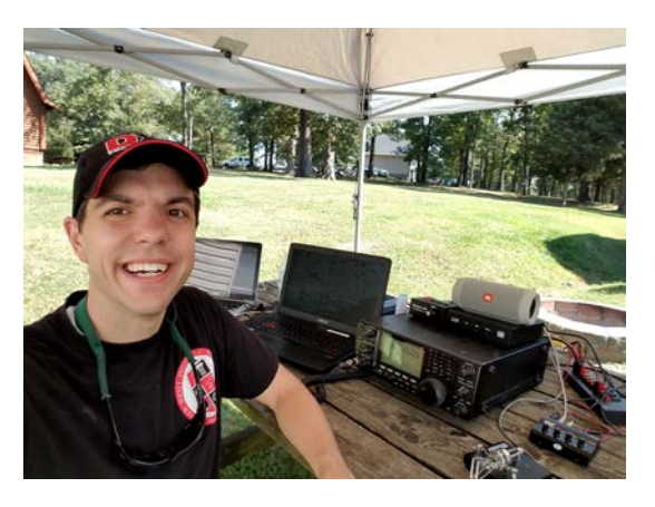
New Jersey Institute of Technology